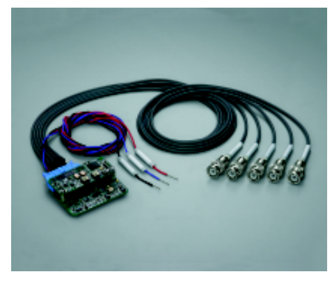
C7884G used in combination with A8226

All you have to do is just insert an NMOS linear image sensor into the socket and connect the cables to an oscilloscope, power supply and AD converter. Note that NMOS linear image sensors are sold separately.